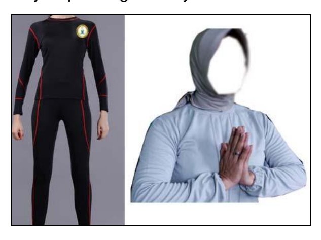
Shirt and Pant

3.2 FEMALE STUDENT DRESS: There is specific uniform for competitors. They can wear only IYC approved uniform i.e. Skin tight sports shirt and tight sports pant or sports shirt and pants, which must be clean and decent with any color. Competitors are not allowed to wear any jewellery or piercings or any kind uniform.