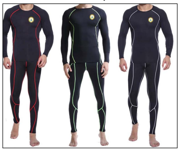
Skin Tight Shirt and Pant

3.1 MALE STUDENT DRESS: There is specific uniform for competitors. They can wear only IYC approved uniform i.e. Skin tight sports shirt and tight sports pant, which must be clean and decent with any color. Competitors are not allowed to wear any other kind of dress.